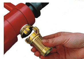
DK09: Coupling exhaust adapter for dry drilling