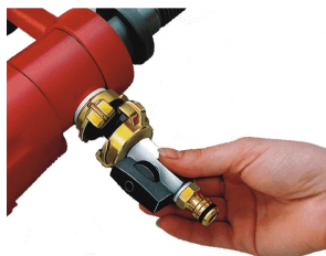
DK09: Coupling ball valve for wet drilling